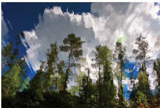
Bedros Artin Azinyan, Rotary Club of Kazanlak, Bulgaria